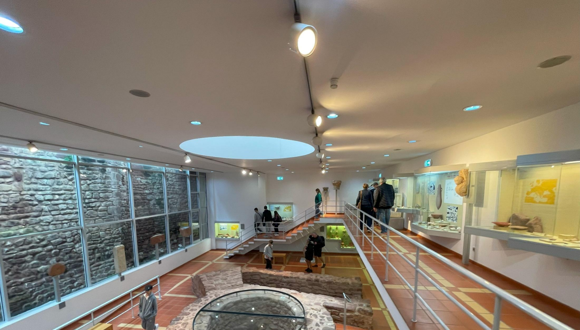
Visit to museum and special visit to the cisterna