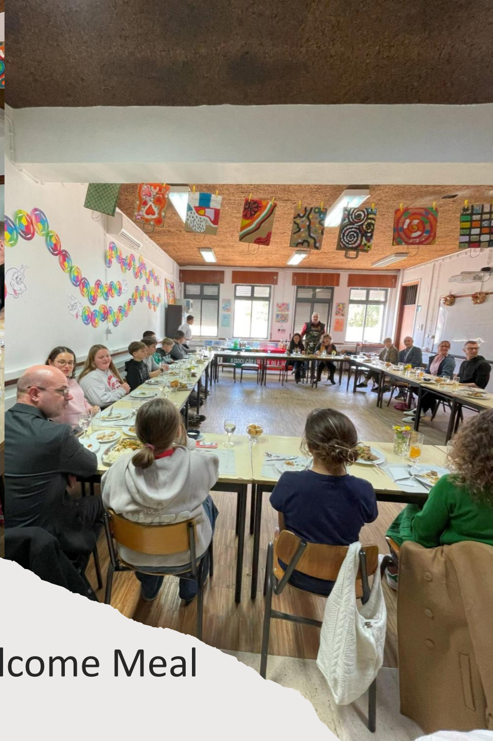
Meeting the Chef