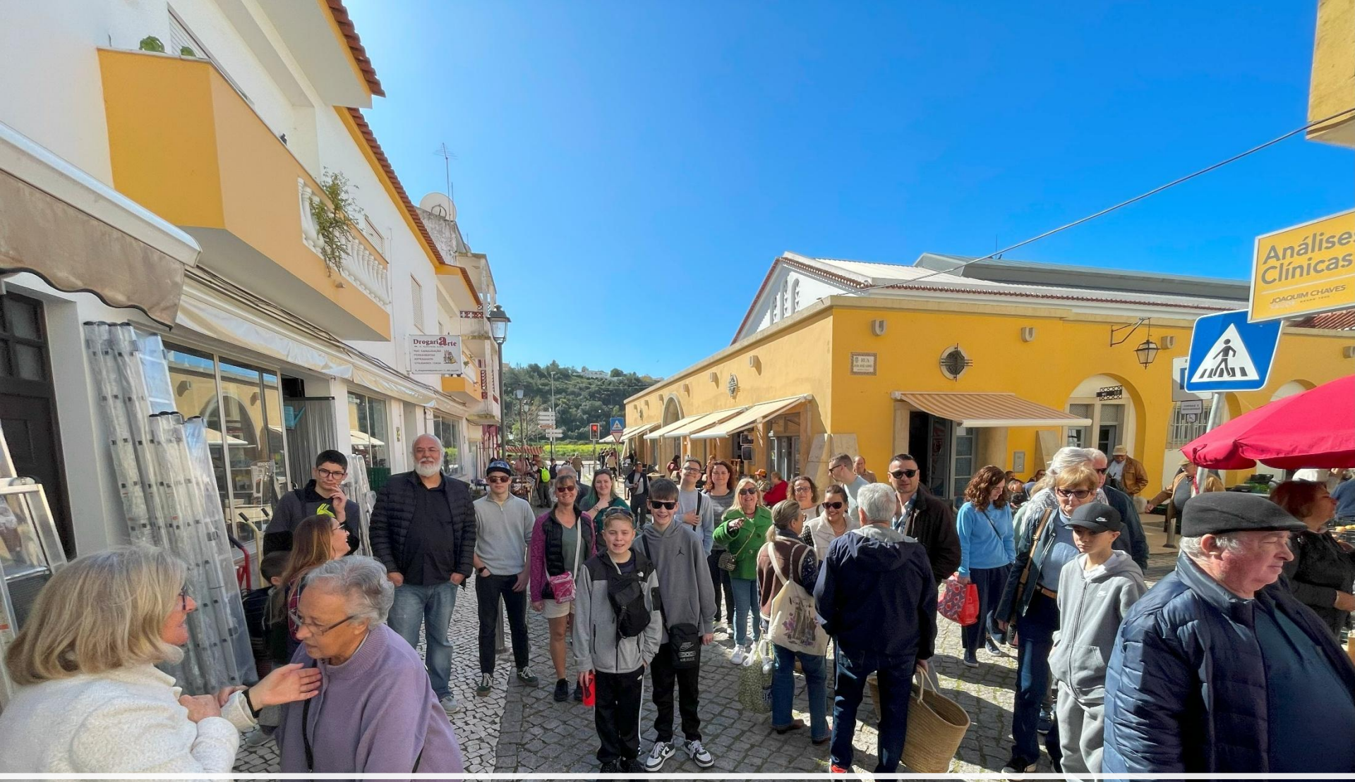
At the market